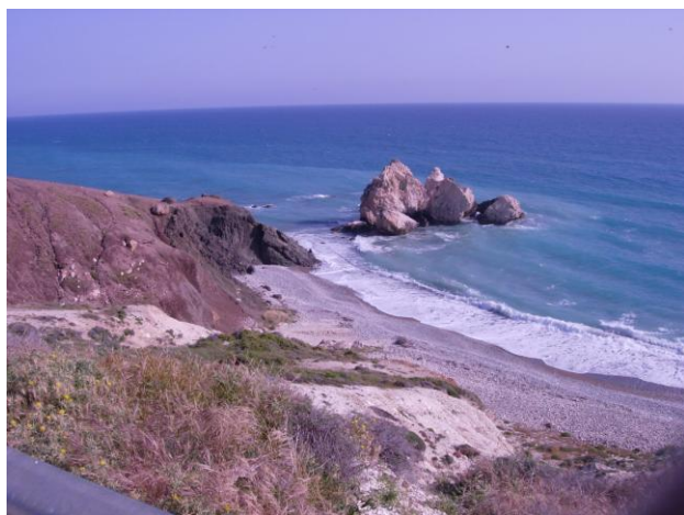
The rocks of Aphrodite, including a mudstone deposit on the left side.

Thus, as Evangelos the cat might say, the study of pithoi affords the researcher a variety of rewards.