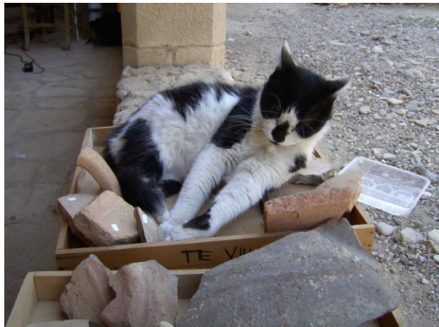
Evangelos, a frequent visitor to the Kouklia Museum and neighboring tavernas, relaxes in a comfortable tray of pithos sherds.

Nodarou and I collected samples of raw materials (clay and rocks) from various sources in the southern part of the island in order to establish the characteristics of local raw materials and their relationships to those used in the pithos fabrics.