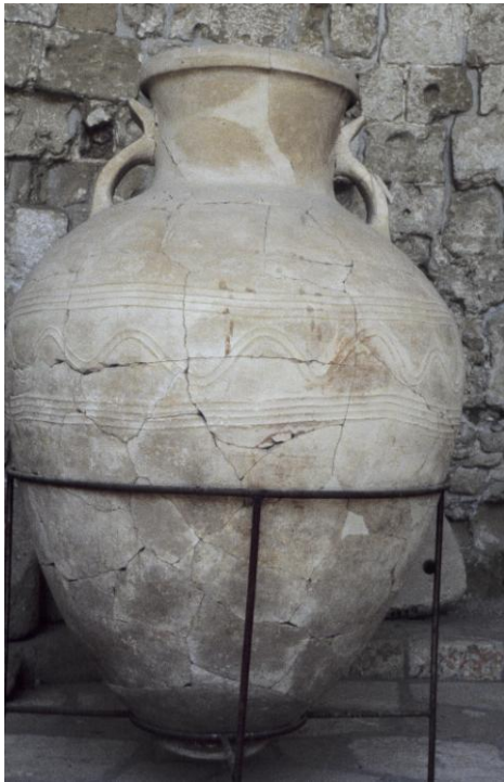
Complete megapithos from the Larnaca region.