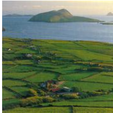
Great Blasket Island viewed from the mainland of Ireland

Studies at MIT and a member of the Princeton Research Forum's Advisory Board.